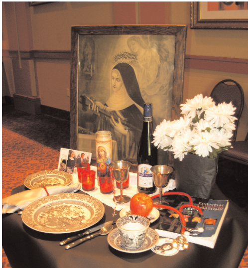
The Place Setting event was held at the same time as the Flea Market. Judy Prophet reports...

Special bargains were there to be found whether you were looking for a marriage piece, “widow or orphan” item or just something that just caught your eye. You could even find pieces from conventions past (souvenir soap dish) as well as one of a kind items such as a popcorn seed keeper with a scoop commissioned by Louise’s Old Things but never produced (as told to me by Irene Black). There were many treasures to be found. I’ve been on the hunt for green and brown willow lately and picked up some really good pieces of green willow from Belgium and the cutest little brown willow creamer. I hope others had as good a time at the flea market as I did.