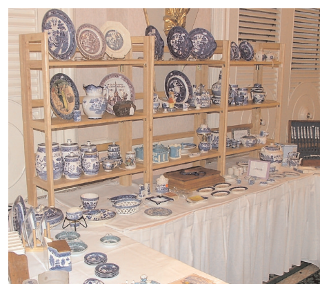
A booth ready for the sale on Sunday.

made from shards, to delicate pieces over 100 years old, there was something for everyone. I shopped the sale and picked up a few things that I knew would fit into my already stuffed suitcase. Buying is so much easier when you drive rather than fly to a convention! Then, it was time to say goodbye to my willow friends – and amigos – and head back to Ohio on the big bird with fond, fond memories of another great convention!