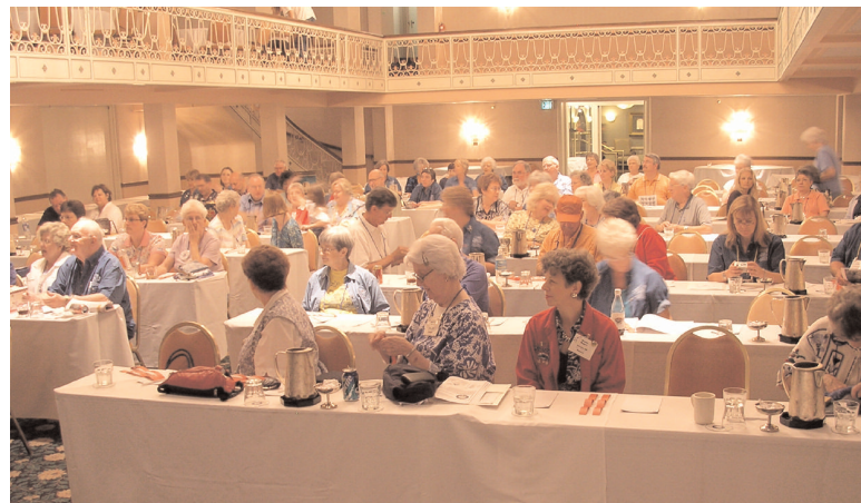
Ready for another raffle drawing.