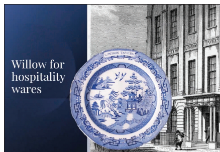
Willow for hospitality wares

So now we look forward to an in-person convention in 2022, and hope things will go as planned for that to happen in Oklahoma City.