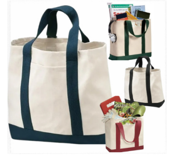
14" Twill Tote: B400-Navy, B400-Green, B400-Black, B400-Red $29.00