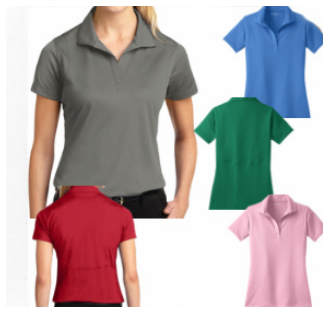
Ladies' Wick Polo: LST650-Gray, LST650-Blue, LST650-Green, LST650-Pink, LST650-Red $37.00