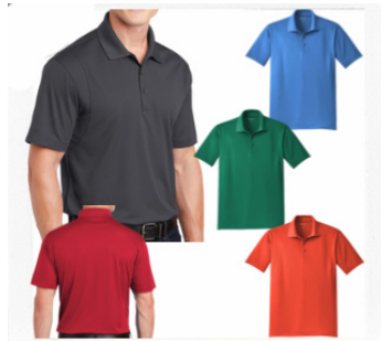
Men's Wick Polo: ST650-Gray, ST650-Blue, ST650-Green, ST650-Orange, ST650-Red $37.00