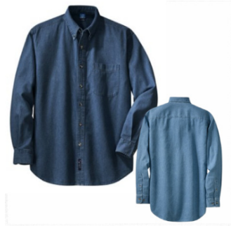
Men's L-Sleeve Denim: SP10-Dark, SP10-Light $39.00