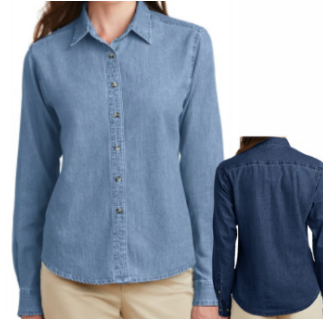
Ladies L-Sleeve Denim: LSP10-Dark, LSP10-Light $39.00