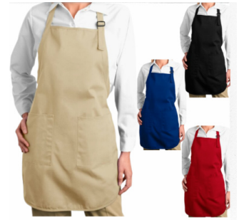
30" Pocketed Apron: A500-Khaki, A500-Black, A500-Navy, A500-Red $24.00